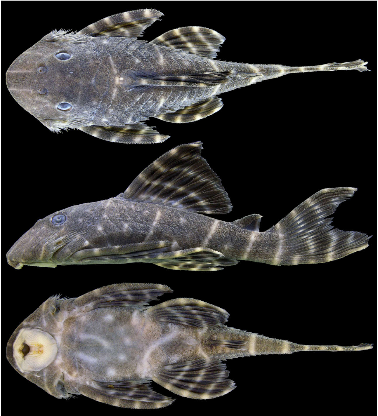
FIGURE 1. Holotype of Panaqolus albivermis n. sp., 95.8 mm SL, Peru, Padre Abad Province, Irazola District, San Alejandro River, Ucayali River drainage, 195 masl, 8°55'02"N, 75°12'26"W, M. Velasquez, 13 June 2009.

Diagnosis. Panaqolus albivermis can be diagnosed from all other Panaqolus except P. maccus by having head, body, and fins with widely separated small white to yellow spots, vermiculations, and/or thin oblique bands on a black base (vs. exclusively small white to yellow spots on a black base in P. albomaculatus , generally broad oblique bands of alternating light to dark brown in P. changae , P. gnomus , P. purusiensis , and a uniformly dark gray to black body color in P. dentex , P. koko , and P. nocturnus ); P. albivermis can be diagnosed from P. maccus by having a black base color (vs. brown), by having parallel dentary tooth rows (vs. acute intermandibular tooth row angle), and by having a larger known adult body size (95.8 mm SL vs. 84.8; Schaefer & Stewart, 1993).